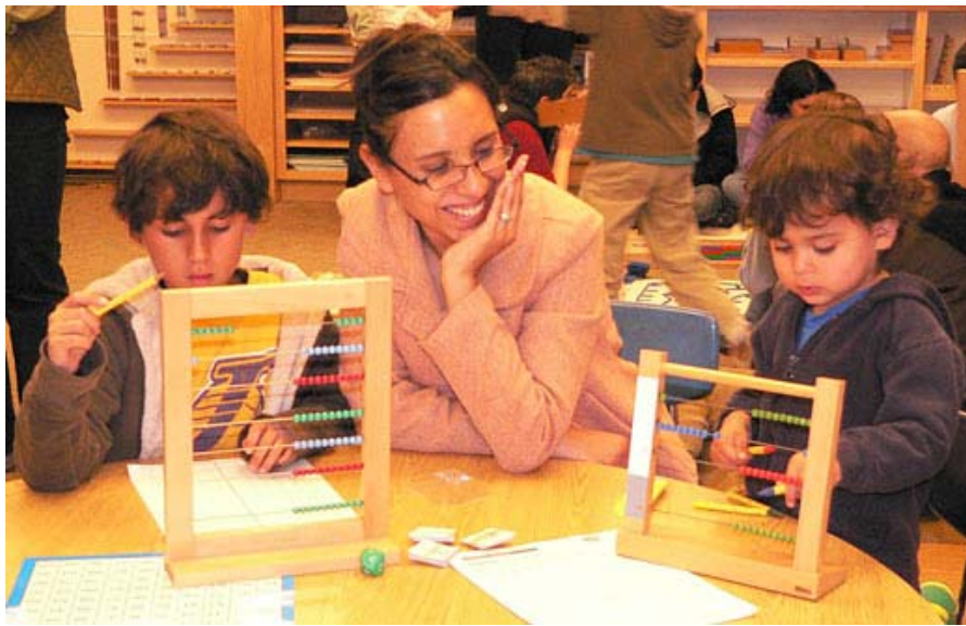
Above and below: Math Night attracted fans of all ages!