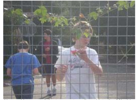
Above: You can tell the temperature dipped into the 30's this week by the way our students bundled up at recess. Oh... wait...