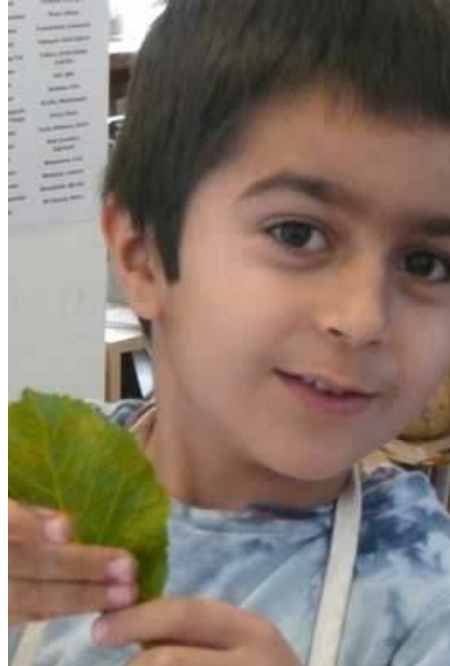
Above and below: K/1 students printing on fabric with hydrangea and geranium leaves in a recent art class.