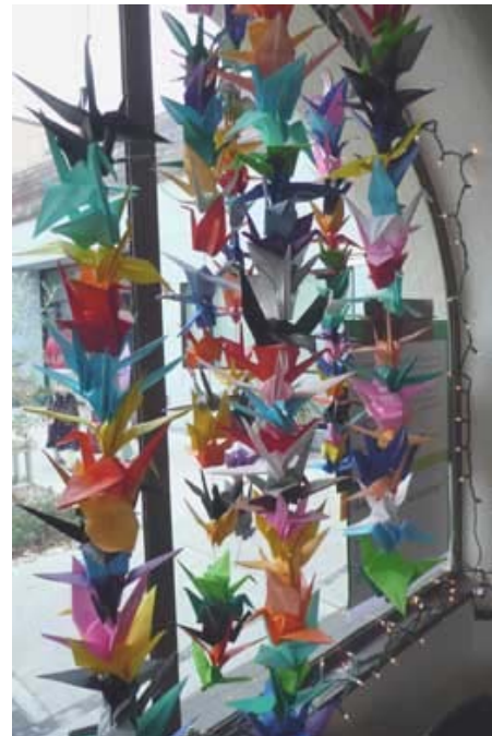
Above: Part of the "1,000 cranes" project at the El./MS. See additional photo and explanation below, left.