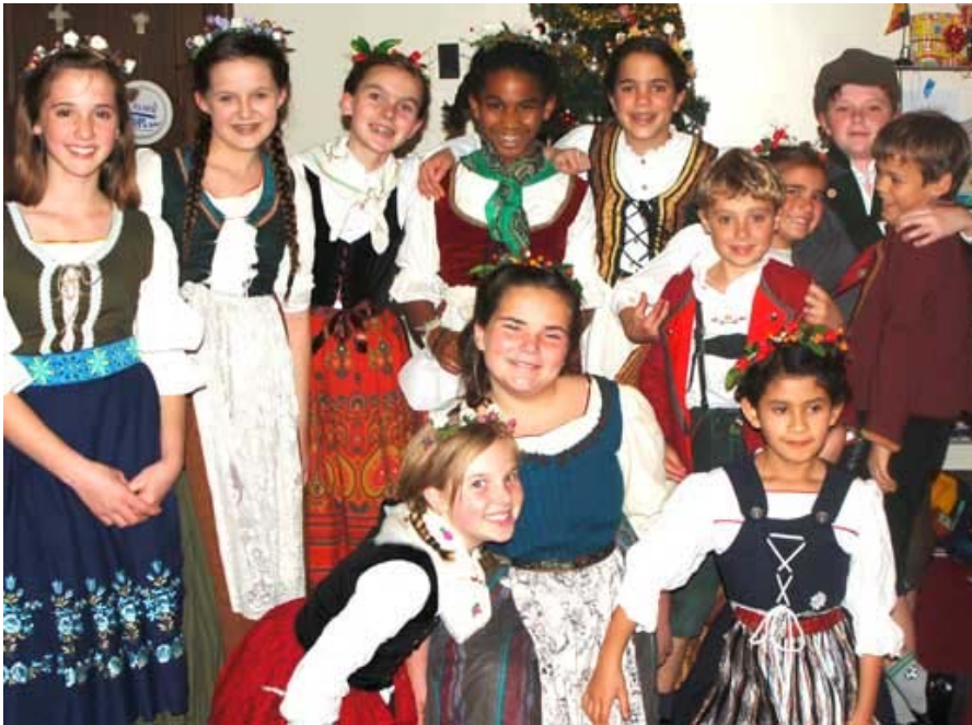
Above: The children performers in this year's Christmas Revels.

For more information or to order tickets, call 510-452-8800 or visit www.californiarevels.org .