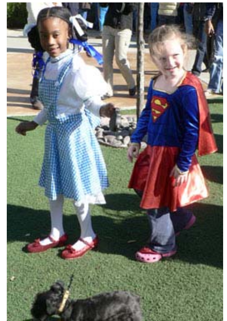
Above: Dorothy and Toto got an escort from Supergirl at the EL/MS Halloween parade. Below: Middle School kids got into the act as well at the parade.