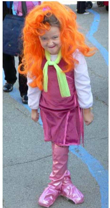
Above and below: Faces from the ECC Halloween parade.