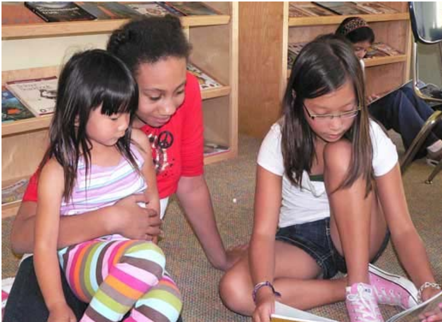
Above and below: Cerrito Creek students read to their "reading buddies" from Blackberry Creek.

If you have children with different dismissal times, and use the drive-through, remember to arrive at the latest time; your younger child(ren) will wait with their older sibling for you. Please note that, if you arrive before or after the ten-minute window for your child's dismissal, you should find street parking so that you can a) wait for your child without causing a traffic back-up, or b) go sign your child out of Extended Day. Please do not expect staff members to leave their curbside posts to go find your child. K-5 students who are checked into Extended Day at the end of their ten-minute window are charged the drop-in rate of $11 per hour, billed by the half-hour.