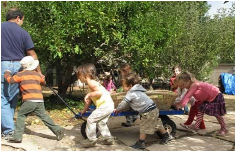
Above: Energetic ECC students help bring in the harvest at the apple farm.